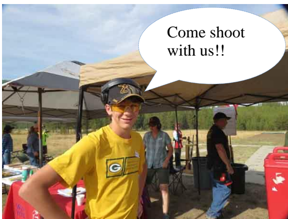
West Yellowstone Shooting Sports Association

Keep the map below for directions on your trap shooting day.